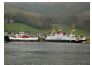
Loch Alainn and Loch Dunvegan at Colintraive

Down on the Clyde, Loch Alainn enjoyed a morning in service following her own overhaul, as she was called in to relieve Loch Dunvegan on the Colintraive - Rhubodach run. The regular vessel lay at her berth with one