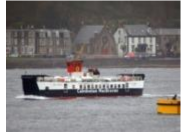
Loch Striven returning to Rothesay

03/12/08 Caledonian Isles is once again spending tonight in Brodick due to the weather forecast. The 0700 sailing tomorrow morning is therefore off. Isle of Arran was able to resume her own supplementary sailings to and from Islay today, as Lord of the Isles took up the roster normally assigned to Hebridean Isles . She commenced her stint as an Islay ferry with the 0700 inward sailing to Kennacraig.