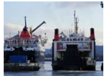
Heb Isles joining Isle of Mull in JWD

Until that time though, a one-ship service will operate, with departures from Kennacraig at 0700, 1300 and 1800. Inward sailings are 0415, 0945 and 1530 from Islay.