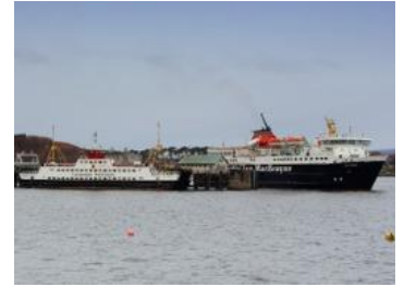
...and joined by Isle of Mull at Craignure

05/02/08 Coruisk and Argyle were playing musical berths today. The former was required to vacate JWD to allow room for other vessels emerging from Garvel. She moved to the wires while Argyle was displaced to Custom House Quay in Greenock. Coruisk should of course be in service running to Bute but is being prevented from doing so by the Council strike by Argyll and Bute staff.