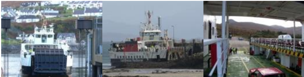
Loch Bhrusda at Mallaig, Eigg and Rum today

13/10/08 Loch Bhrusda sailed for Eigg at 1030 this morning, following behind Ullin of Staffa . She arrived at Eigg at 1200 and left again at 1300. Her inward sailing was diverted via Rum in order to pick up a large student party that the smaller vessel was unable to carry. Arrival in Mallaig was further delayed awaiting the departure of Coruisk .