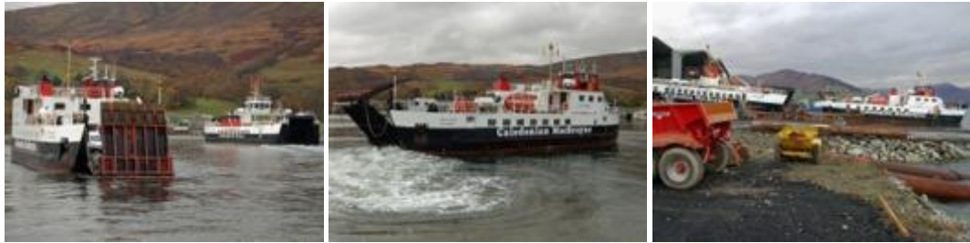
Loch Buie meeting Loch Alainn at Rhubodach and then Loch Linnhe at Ardmaleish

14/11/08 Loch Buie did indeed sail early from Campbeltown this morning, passing through the Kilbrannan Sound and the Kyles of Bute before arriving at Rhubodach at 1130. She unloaded crew cars and then set sail for Ardmaleish where she was to go straight up onto the slip.