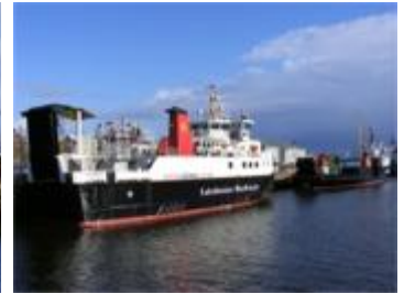
Lochnevis nearest with Saturn ahead