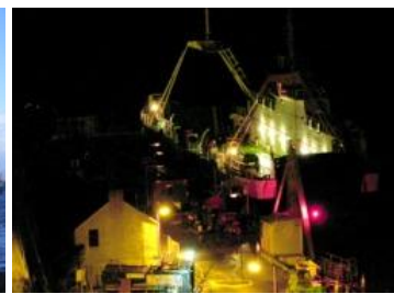
Loch Fyne today: with Loch Shira off Largs and alongside at Port Askaig

01/03/08 Raasay is now noted running on the Oban - Lismore service. Eigg is up at Corpach undergoing her annual overhaul