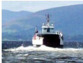
Loch Bhrusda leaving for Gourock

21/08/08 Loch Bhrusda came off the Largs - Cumbrae Slip run this afternoon and then made her way at 1535 north to Gourock where she is to lie at the wires berth until next needed. Loch Riddon arrived back in Largs 40 minutes after her relief cover departed.