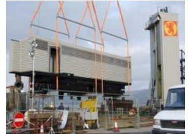
Rothesay gangway being dismantled

The Mersey Mammoth returned to Rothesay today and undertook the next phase in the redevelopment of the pier. She was involved in the dismantling of the 'old' gangway which is being moved to Ardrossan.