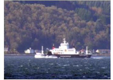
Coruisk heading from Gourock to Rothesay

The 0700 ex Kennacraig was diverted to Port Askaig