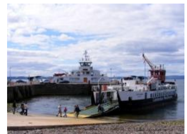
Loch Riddon in single service at Largs

Loch Shira was off service for a while this afternoon due to a steering problem, leaving Loch Riddon to carry out Cumbrae sailings alone. The larger vessel was back in service from 1645.