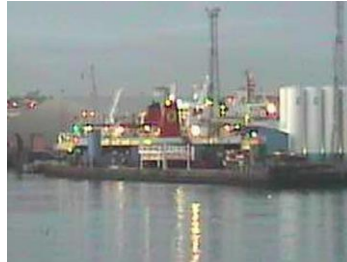
Isle of Arran on Aberdeen webcam

28/01/08 Isle of Arran can clearly be seen on the Aberdeen harbour webcam this morning. Thanks go to Forum member G-Pat Ile who was first to spot her on the webcam! She arrived at around 1800 last night.