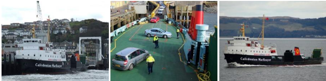
Saturn back in service on her original route

19/03/08 Saturn left Rosneath at around 1000 this morning and made for Rothesay. She picked up the Wemyss Bay roster with the 1145 sailing from Rothesay, displacing Coruisk . With Saturn now sailing to Bute, vehicles are having to load and discharge via her stern ramp due to the old side-loading linkspan being removed. Here is a series of photos of Saturn back on the Bute run: