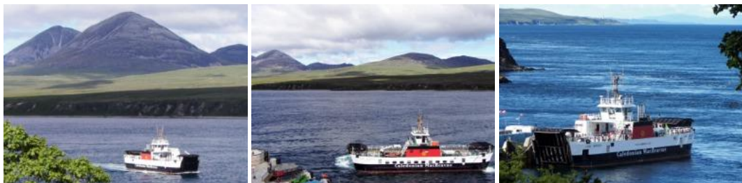
Loch Bhrusda arriving at Port Askaig this evening for an overnight berth