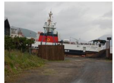
Loch Bhrusda on Ardmaleish slip

Loch Bhrusda left Rothesay at 0945 heading north to Ardmaleish where she went straight onto the slip for repairs.