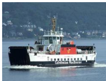
Loch Bhrusda heading down the Clyde

Loch Tarbert had been due to divert an afternoon sailing to Tarbert, however weather conditions saw this cancelled, along with her roster for the rest of the day.