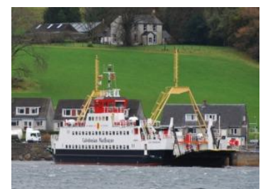
Loch Dunvegan off service