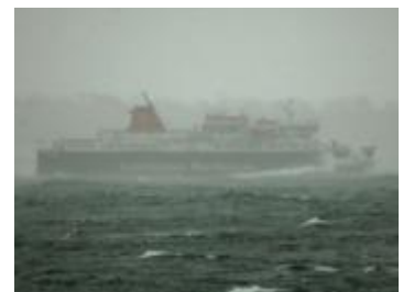
Caledonian Isles seen from Kilchattan Bay on Bute