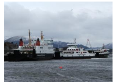
Argyle, Loch Shira and Jupiter at Gourock

The vessel was over an hour late this morning due to weather conditions and volume of traffic. She left Islay at 1100 on a delayed 0945 inward sailing.