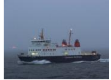
Bute in the poor evening light off Dunoon

With Hebridean Isles due to arrive back on the scene at Islay, Lord of the Isles left this evening to return to Oban. With the cancellations of today, she will carry out an extra 0815 sailing to Colonsay tomorrow morning, before sailing with stranded traffic to Castlebay and Lochboisdale at 1345.