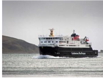
Hebrides en route for Oban...

Hebrides was seen on Brodick's webcam at the berth early this morning. She sailed from Brodick at around 0830 this morning bound for berthing trials in Oban. She passed through the Sound of Islay mid afternoon and was off Port Askaig at 1430.