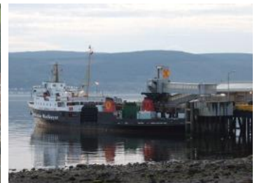
Saturn lying alongside at Wemyss Bay

21/07/08 One of the Largs - Cumbrae Slip ferries, reportedly Loch Shira , was off service for a while today and Loch Riddon was called on to sail alone during the afternoon. The larger ferry, we understand, returned to service in the evening.