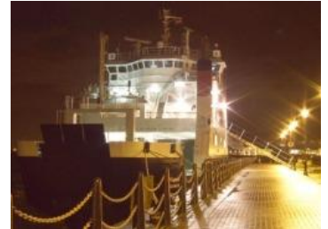
Coruisk at CHQ tonight

Clansman has commenced her winter relief service to Lewis, running to a retimed schedule, as follows: