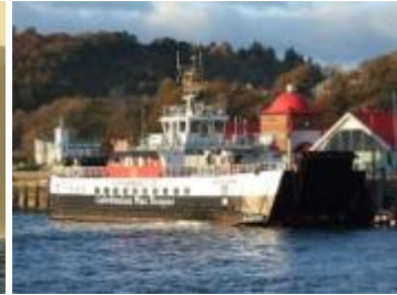
Loch Alann following Isle of Mull towards Oban and then at the North Pier

29/10/08 Loch Linnhe provided two special sailings to and from Lismore today to convey a large load with a farm building, albeit in kit form, Meccano style! Eigg was in service on the normal roster and these sailings by Loch Linnhe were in addition and by prior arrangement.