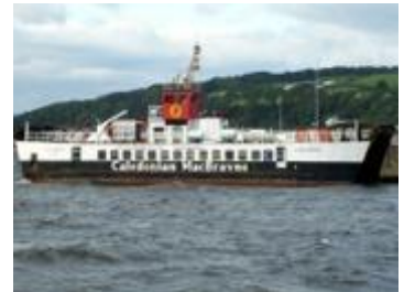
Loch Riddon having arrived back at Largs

18/08/08 Loch Riddon left Gourock this morning and headed round to lie opposite Ardmaleish while the slipway was readied for her arrival. She was then slipped to have her leaking prop blade seal seen to.