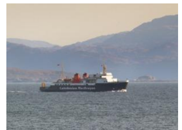
IoA passing Eigg and heading for the Sound of Mull