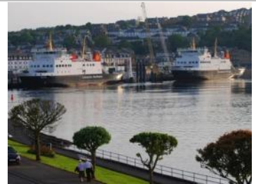
Rothesay pier tonight

29/05/08 For the first time in several months, both Rothesay ferries were able to stay overnight at the pier on Bute. Argyle lay at the old side-loading berth, minus linkspan while Bute lay at the new loading berth. As a result the timetable has returned to normal and the 1815 sailing no longer goes to Gourock.