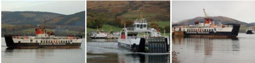
Loch Alainn, Loch Linnhe and Loch Dunvegan around Bute

01/11/08 Loch Alainn left Campbeltown early this morning and proceeded up the Kilbrannan Sound and via the Kyles of Bute to Rhubodach where she unloaded crew cars. Shortly afterwards she headed down to Ardmaleish where she met with Loch Linnhe . The smaller vessel had arrived earlier in the day and tied up at the pier. Loch Alainn was aligned with the slipway and then taken out of the water.