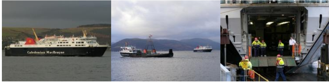
Isle of Lewis: a) approaching Gourock - b) passing Jupiter - c) bow-in at the linkspan

Isles and Sound of Mull for shelter. She berthed bow-in at Gourock at 1430 just after Jupiter departed with the Dunoon sailing. She then unloaded crew vehicles, took on a pilot and sailed for JWD where she berthed starboard side to the north dock wall. A selection of photos can be seen below: