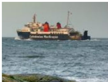
Isle of Arran leaving West Loch Tarbert...

Lord of the Isles saw her 0700 sailing from Kennacraig diverting to Port Askaig; something which Isle of Arran copied with her 0945 ex Kennacraig. Lord of the Isles then left Port Askaig some 45 minutes late for the return sailing, however she made up all that time with a following wind and tide and was in Kennacraig for 1205.