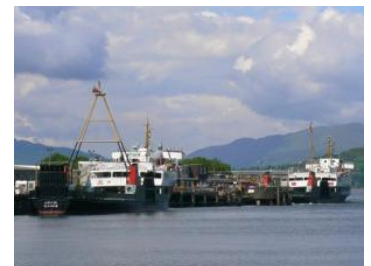
Jupiter and Saturn at Gourock yesterday

Loch Alainn left Barra today and is spending tonight at Tobermory as part of her journey to Corpach for repairs.