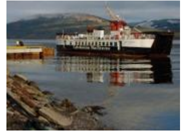
Loch Striven at Ardmaleish

29/11/08 Hebridean Isles left Kennacraig at 0600 this morning and made her way round to the Clyde for the second time in a week. She dropped off crew cars at Gourock, where she bumped into Bute , before moving up to JWD for the night. Isle of Arran is looking after the Islay sailings on her own for the time being, however Lord of the Isles is rumoured to be heading down to assist once she is freed up by the return of Isle of Mull at Oban.