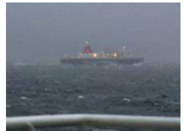
Caledonian Isles seen from Argyle at 1520

Loch Shira was off service from 1645 until shortly after 1900.