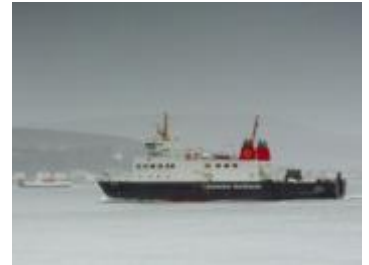
Loch Alainn and Bute at Rothesay

18/12/08 Loch Portain was noted running almost two hours late due to weather conditions this morning, her 0815 sailing leaving Berneray at 1000 for Leverburgh and immediate return.