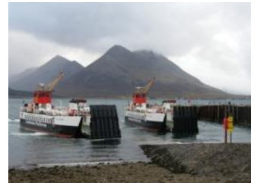
Loch Striven and Loch Linnhe changing over

Pentalina B left Stornoway at 1130 this morning as her charter to CalMac came to an end. She was due to head back to St Margarets Hope to spend Christmas in the company of her new fleetmate, catamaran Pentalina which finally arrived recently.