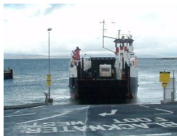
Loch Tarbert returning to Arran

Isle of Arran left Port Askaig at 0945 for Kennacraig. She then sailed at 1230 for Craignure for a sheltered overnight berth, due to the forecasted overnight gales. She arrived at Craignure later this afternoon.