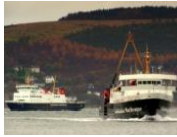
Argyle and Jupiter off Gourock

In non weather-related news, Loch Riddon has left Rothesay (we're not sure exactly when) and is somewhere between there and Mull, where she is due to relieve the Loch Buie in the next few days.