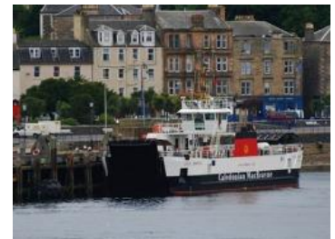
Loch Bhrusda calling at Rothesay

Loch Bhrusda emerged from her lay up berth at Rosneath today and made for Rothesay first of all before heading for Lochranza and an overnight berth in the company of Loch Tarbert . She is en route for Barra where she is to relieve the Loch Alainn which is in need of repairs.