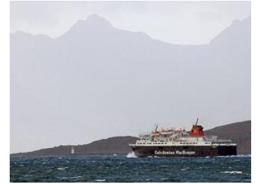
Caledonian Isles heading from Gourock to Brodick

Caledonian Isles diverted her 0820 ex Brodick sailing to Gourock. After reloading she then left for Brodick again at 1105. Normal service resumed with the 1350 to Ardrossan.