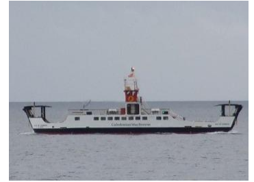
Isle of Cumbrae off Toward

20/02/08 Isle of Cumbrae was out and about again today on the Upper Clyde. She was spotted passing Toward Point and looked to be heading for the Kyles of Bute. She was, however, back at the inner berth at Rothesay this evening