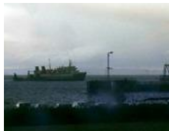
Hebridean Isles circling off Brodick