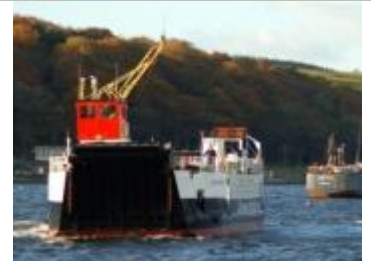
Loch Riddon arriving back at Rothesay

31/10/08 Loch Riddon left Ardmaleish and returned to Rothesay to finish her overhaul at the inner berth. Loch Linnhe left Campbeltown and is assumed to be heading for Bute and her own overhaul at Ardmaleish. Loch Alainn in turn left Oban bound for Campbeltown where she is spending tonight. Coruisk was observed passing through the Sound of Islay at over 17 knots this afternoon – she obviously caught the ebb tide which increased her speed somewhat. She left Craignure this morning and arrived at JWD this evening, after a call at Gourrock to discharge crew cars at 1720, following Jupiter departing for Dunoon. Saturn is also back at the wires in Gourrock now. Presumably she will be moving over to Rosneath to lie alongside the lonely Juno before too long.