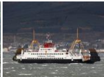
Loch Alainn, Loch Dunvegan and Caledonian Isles on the Clyde today