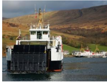
Loch Bhrusda at Rhubodach to pick up crew cars

08/03/08 Loch Tarbert sailed from Craignure at 0730 bound initially for Port Askaig, however her destination was amended to Craighouse, where she arrived at 1630. Lochnevis made an additional call at Muck today at 1355, before making for Eigg (1430) and Mallaig with stranded traffic. Lord of the Isles' 0645 sailing to Coll and Tiree was delayed this morning due to loading problems which involved the vessel putting back to the berth after her first departure. Isle of Arran diverted her sailing to Port Askaig this evening. She is lying there until 0945 tomorrow when she will return to Kennacraig.