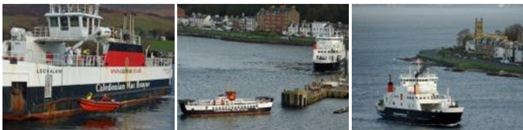
Loch Alann conducting drills, Loch Linnhe out on trials and Coruisk arriving on Bute

Meanwhile, over on Bute, Loch Linnhe was out and about on trials around Rothesay Bay too this afternoon.