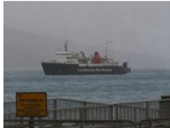
Isle of Arran approaching Mull...

Isle of Arran left Port Askaig this morning after her run from Kennacraig, bound for Caignure and overnight shelter. She arrived during a very stormy spell and circled in the bay several times before managing to get alongside.