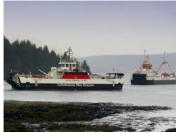
Loch Fyne with Loch Alann at Fishnish...

06/02/08 Loch Alann relieved Loch Fyne on the Lochaline - Fishnish run this morning. The latter left Lochaline at 0945 and made for Craignure (arriving 1020) while Loch Alann settled in to her latest relief duty. Ironically this was of course the route for which she was originally intended...though we all know what happened 11 years ago!