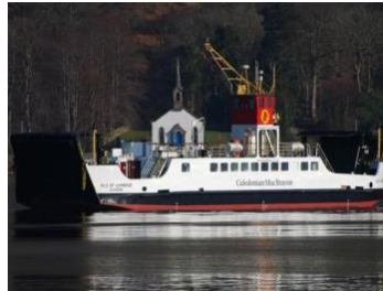
Isle of Cumbrae in the Kyles

19/02/08 Isle of Cumbrae was out on trials in the Kyles of Bute today. She made it nearly as far as Rhubodach before testing her inflatable liferaft and then headed for Gourrock and an overnight berth.