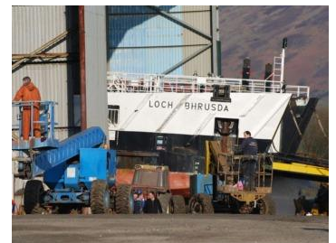
Loch Bhrusda at Ardmaleish

It appears to be a case of 'Fog on the Clyde' today as the Loch Riddon was fogbound at Tarbert this lunchtime and was unable to sail to Lochranza. Loch Dunvegan is also reported to be affected, along with Bute and Coruisk . The current situation (1355) shows Coruisk running approx 20 minutes late and Bute around 10 late.