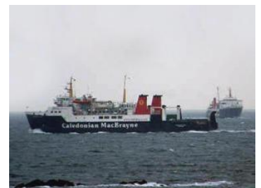
IoA and Heb Isles off Port Ellen

16/02/08 There was a convoy heading for Port Ellen this morning. Hebridean Isles sailed an normal at 0700, with Isle of Arran following close behind. The recently overhauled Isle of Arran waited outside Port Ellen bay while her fleetmate discharged and reloaded, before berthing at 1010 after the other vessel had sailed for Kennacraig.