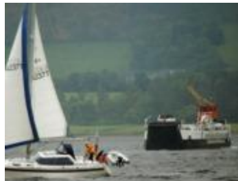
Loch Riddon lying off Ardmaleish

18/08/08 Loch Riddon left Gourock this morning and headed round to lie opposite Ardmaleish while the slipway was readied for her arrival. She was then slipped to have her leaking prop blade seal seen to.