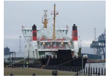
Argyle at CHQ