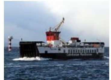
Loch Linnhe entering Oban Bay

All sailings on the Ullapool – Stornoway route were cancelled today due to the weather. Hebrides was again running approx 40 minutes late as a result of weather conditions.