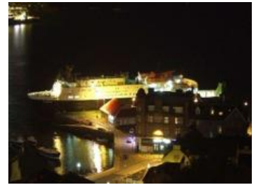
Clansman at the north pier tonight

16/10/08 Lord of the Isles had to turn back on her sailing from Oban to Lochboisdale and Castlebay this evening due to technical difficulties. AIS showed her returning at approximately 10 knots. Isle of Mull sailed for an overnight berth at Craignure in order to create space for the stricken Lord of the Isles in Oban, with Clansman unusually spending the night at the north pier.