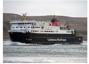
...and approaching Port Askaig

Isle of Mull missed her first sailings to Craignure and eventually sailed at 1100. Upon returning from Craignure she then sailed at 1325 for Colonsay, however she was unable to berth and returned to Oban. For full details of disruptions encountered today, click HERE for the relevant page on the SoC Forum