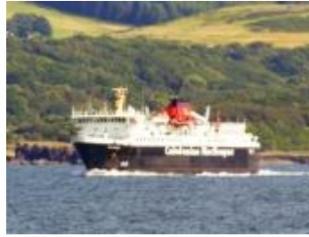
Isle of Mull approaching Tobermory

22/08/08 Isle of Mull came off the Oban - Craignure run at 1345 today and handed over the service to Clansman as of the 1400 sailing. The Mull ferry then left Oban at 1430 bound for Castlebay on a delayed 1340 sailing. This was to allow Clansman to carry out a cattle sales sailing to Tiree at 2000. Things didn't go according to plan however as the Mull sailings were fully booked and the vessel was forced to use her mezzanine deck which made her run late. The 1900 ex Craignure eventually left at 1950. Isle of Mull passed Tobermory at 1610, passing Loch Linnhe which slowed to allow her to overtake.