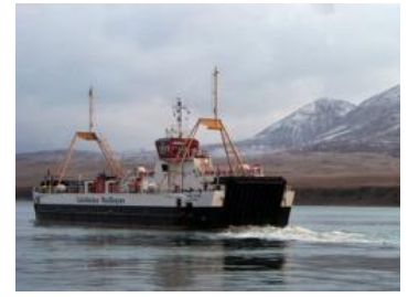
...and heading out into the Sound of Islay

02/03/08 Loch Fyne left JWD again today and this time went down to Largs where she lay off before loading crew cars. She then left and made for Port Askaig, arriving at 2130. See below for a selection of photos her en route: