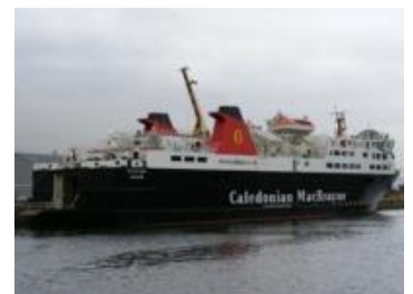
Isle of Lewis back in JWD

21/01/08 Isle of Lewis and Loch Shira left Garvel dry dock this morning. The larger vessel was towed into the adjacent JWD, berthing first on the south wall to allow her port side lifeboat to be lowered. She was then moved across to the Garvel side wall. Loch Shira then moved into place under her own power.