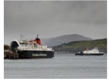
Caledonian Isles and Argyle at Gourock

Loch Alainn left Gourock at 0845 this morning and battled through the swell, round Toward Point and into the Kyles of Bute where she took over the Colintrave - Rhubodach service.