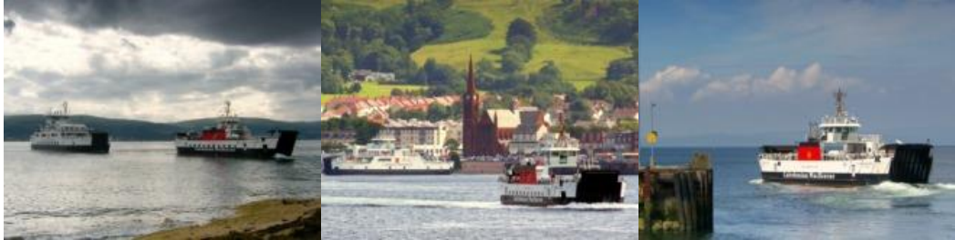
Loch Bhrusda relieving for Loch Riddon on the Largs - Cumbrae run today

Loch Bhrusda suffered problems with one of her ramps early this afternoon and was forced to sail single ended for a while. Loch Riddon was recalled early from Greenock to allow the relief vessel away, and resumed service alongside regular consort Loch Shira . Loch Bhrusda then left for Gourrock and an overnight berth at the wires. She was spotted passing Inverkip shortly after 2000.