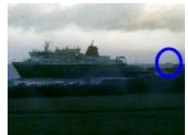
Caledonian Isles and Hebridean Isles (circled) at Brodick

Hebridean Isles was unable to berth at Brodick due to strong north-westerly winds and spent the whole morning circling between Holy Isle and Corrie. She did attempt to berth at Brodick several times but was unsuccessful.