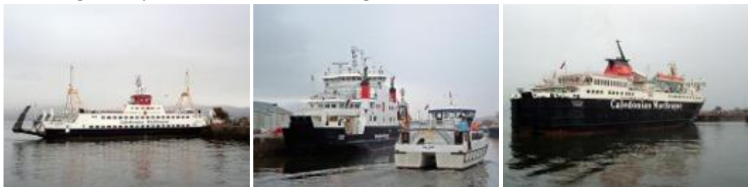
Loch Dunvegan and Isle of Mull arriving at Garvel and Ali Cat joining Coruisk in JWD

Isle of Mull arrived at Gourock at around 0720 this morning and unloaded crew cars before moving upriver to Garvel, entering the dry dock behind Loch Dunvegan .