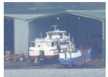
Ali Cat high and dry for overhaul