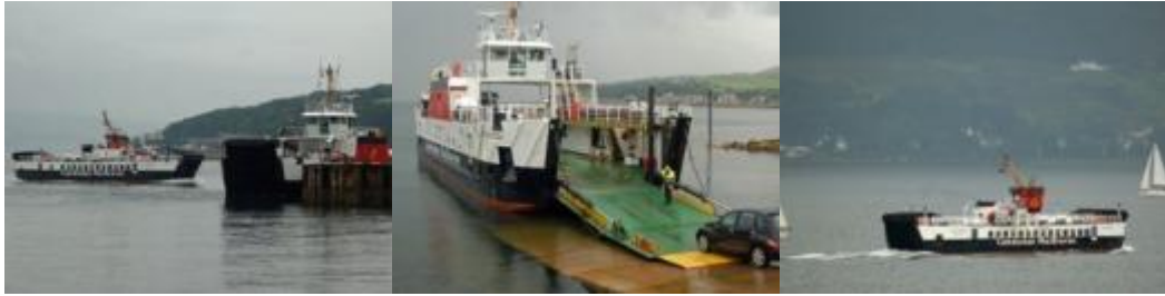
Loch Riddon handing over to Loch Bhrusda and making for Gourock

09/08/08 Loch Tarbert was unable to berth at Claonaig with the 0815 ex Lochranza this morning and had to put back to Arran. Her 0930 sailing was consequently diverted to Tarbert. The return sailing left at 1145 and she reached her home base at 1325 and was able to resume her normal roster, albeit 10 minutes behind schedule.