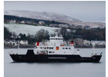
Coruisk in Rothesay

Loch Shira left JWD earlier this morning and made her way down the Clyde to Largs, where she resumed service to Cumbrae at 1215. Loch Alann left Largs at around 1230 and is making her way via the Kilbrannan Sound to Campbeltown for an overnight berth.