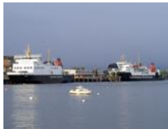
Hebridean Isles and Bute at Gourock

29/11/08 Hebridean Isles left Kennacraig at 0600 this morning and made her way round to the Clyde for the second time in a week. She dropped off crew cars at Gourock, where she bumped into Bute , before moving up to JWD for the night. Isle of Arran is looking after the Islay sailings on her own for the time being, however Lord of the Isles is rumoured to be heading down to assist once she is freed up by the return of Isle of Mull at Oban.