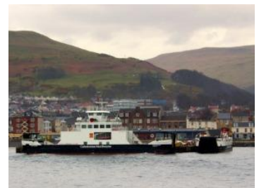
Loch Portain and Loch Riddon at Largs

08/04/08 Loch Portain left Greenock at around 1330 bound for Largs, where she arrived at 1525 and berthed at the outer face of the pier. It appears she required further work following her overhaul as she was still there at 1900 this evening.