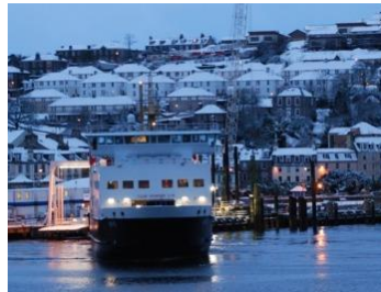
Bute in the snow

Coruisk appeared in Rothesay today after returning from King George V dock in Glasgow. She undertook berthing trials at both Wemyss Bay and Rothesay before heading back up to JWD for the night. She is expected to re-enter service with the 1215 ex Rothesay tomorrow, while Argyle is away for her first overhaul.