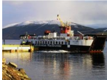
Loch Ranza at Ardmaleish

Coruisk came out of Garvel dry dock at 1030 this morning. She was later seen on trials this afternoon and is spending tonight alongside Custom House Quay in Greenock.