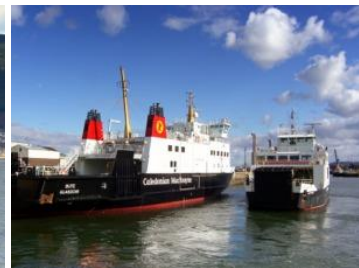
Loch Portain today: with Loch Shira off Largs, passing Dunoon and at JWD