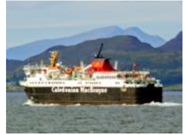
Isle of Mull heading out past Kilchoan

21/08/08 Loch Bhrusda came off the Largs - Cumbrae Slip run this afternoon and then made her way at 1535 north to Gourock where she is to lie at the wires berth until next needed. Loch Riddon arrived back in Largs 40 minutes after her relief cover departed.