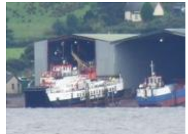
Loch Riddon being slipped

16/08/08 Loch Tarbert was again diverted to Tarbert today. After completing her schedule as normal until 1035 she then sailed at 1200 for Tarbert, returning from the Kintyre port at 1400. This was then repeated with another round trip from Arran at 1545 and Kintyre at 1730.