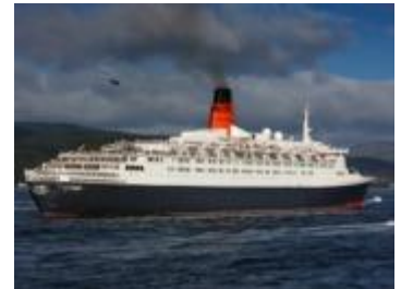
QE2 seen from Saturn

05/10/08 Loch Riddon left Largs at 1020 this morning bound for Lochranza, passing the visiting QE2 en route. She then picked up the Claonaig - Lochranza sailing with the 1315 sailing. Loch Tarbert came off the service at 1305 and made for Gourock Wires via Largs for repairs and maintenance. Saturn undertook two special cruises to see the QE2, leaving Gourock at 1000 and 1400, and Dunoon at 1030 and 1430.