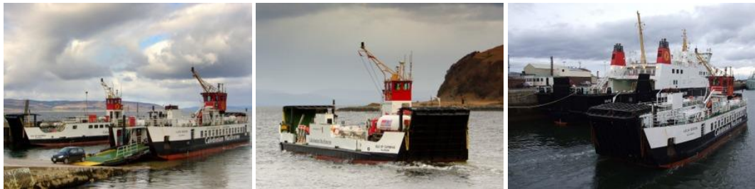
Isle of Cumbrae changing with Loch Riddon, and the latter entering JWD

Isle of Cumbrae sailed from Gourock this morning and made for Lochranza where she relieved Loch Riddon on the Tarbert - Portavadie/Lochranza run at 1345. Loch Riddon then made for JWD where she arrived at 1715 for ramp repairs. The following pictures were taken during the course of the day: