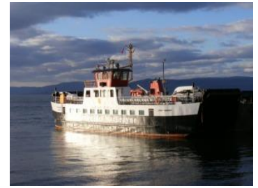
Loch Tarbert at Largs pier

16/03/08 Loch Riddon has suffered a technical problem with her bow ramp (the one she uses at Tarbert in the winter and at Cumbrae Slip in the summer). She is currently sailing single ended with vehicles reversing on. The picture to the right shows her 'wrong way round' at Tarbert this evening.