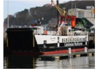
Loch Ranza back from Ardmaleish

19/01/08 Loch Ranza has moved back to Rothesay's inner berth after being unslipped from Ardmaleish.