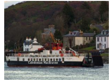
Loch Riddon at Tarbert

Loch Portain arrived at Largs at 1125 this morning and unloaded crew cars. She then left at 1140 as Loch Shira approached, bound for JWD in Greenock. She cautiously entered the wet dock at around 1330, berthing in front of Bute.