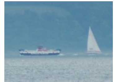
Loch Tarbert en route for Gourock

Loch Riddon left Largs early this morning and proceeded to Lochranza where she is now in service on the secondary Arran route. Loch Tarbert then made for JWD and was observed passing Wemyss Bay on her way north. With Loch Riddon away from her summer base and Loch Bhrusda otherwise engaged in the Western Isles, Loch Shira is currently providing a half-hourly timetable on her own.