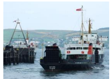
Saturn and Jupiter at Gourock

12/05/08 Jupiter came off the Dunoon service today and proceeded to Garvel to commence her annual overhaul. Saturn stepped in to relieve her older sister for the 1420 sailing to Dunoon.