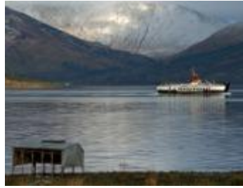
Loch Striven passing Loch Striven!

Loch Striven arrived on Bute today and was immediately slipped at Ardmaleish, alongside Loch Alainn .