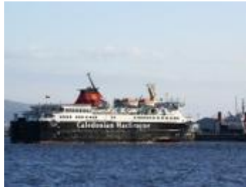
Isle of Mull leaving JWD

Loch Dunvegan was observed working single-ended for a while today - presumably due to technical problems affecting one of her ramps.