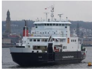
Coruisk leaving JWD

05/02/08 Coruisk and Argyle were playing musical berths today. The former was required to vacate JWD to allow room for other vessels emerging from Garvel. She moved to the wires while Argyle was displaced to Custom House Quay in Greenock. Coruisk should of course be in service running to Bute but is being prevented from doing so by the Council strike by Argyll and Bute staff.