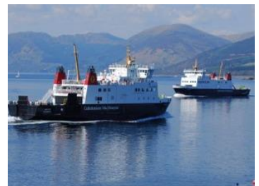
Argyle passing Bute in Rothesay Bay