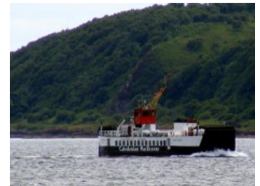
Loch Riddon returning to Largs

Hebridean Isles saw her 1300 service to Islay diverted to Port Ellen this afternoon due to power issues affecting Port Askaig. She arrived at Port Ellen at 1520 and left at 1545.