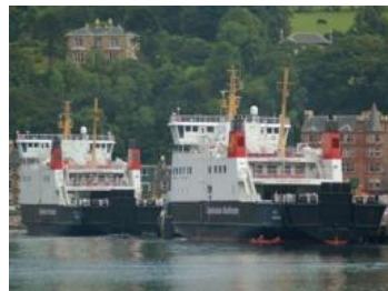
Bute lying off service at Rothesay

23/07/08 Bute suffered technical problems on her 0845 ex Wemyss Bay this morning and was forced to sail over to Rothesay using only one azi-pod at an average speed of 8.5 knots. She then moved to the overnight berth where the old linkspan used to be and Argyle was forced to sail alone on a 50% frequency timetable for the remainder of the day. It was later announced that Saturn was to move north to her old haunts and cover for the stricken Bute . In the end she sailed from Ardrossan to Wemyss Bay for an overnight berth - a rare event these days!