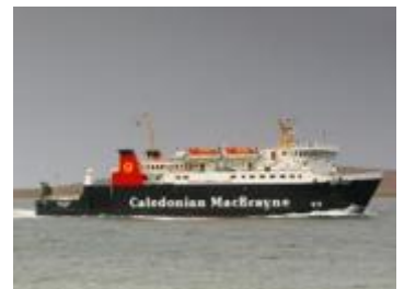
...and Lord of the Isles appearing not long after

17/12/08 Coruisk left Gourock and proceeded up to Glasgow and a lay up berth in the KGV dock