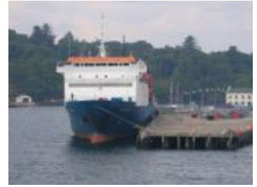
Muirneag back alongside

26/07/08 With Isle of Lewis covering overnight duties for the Muirneag , today's timetabled sailings between Ullapool and Stornoway were subject to delays. The unfortunate freight ferry left Stornoway around 1640 bound for Aberdeen, presumably for dry docking and a damage inspection, though it is believed there was no damage to the vessel following her encounter with the local rocks.