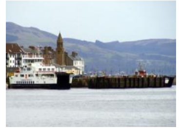
Loch Shira and Loch Riddon at Largs

Loch Riddon is noted back in Largs today after her recent visit to Rothesay. She was there to shelter from the predicted bad weather on the night Loch Shira went up to Gourock. She can be seen in the photo to the right, behind the pier while Loch Shira is at the slipway.