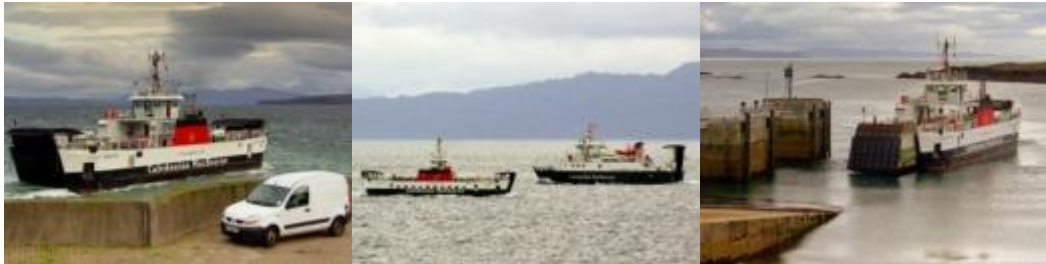
Loch Bhrusda seen on berthing trials in the Small Isles

16/09/08 The reason for Loch Bhrusda's jaunt to Mallaig became clear this morning. She left the outer harbour at 1010 and made a beeline for Eigg, with Lochnevis following 10 minutes behind. She berthed at 1135 as the regular vessel passed by en route to Muck, and then left again at 1145. The two ships then passed each other off Muck and the Loch Bhrusda made her first call at Muck, arriving at 1230 and leaving again at 1245. Tidal conditions delayed Lochnevis at Muck by 15 minutes and she was unable to make this time up again at the 2nd Muck call.