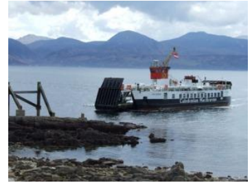
Loch Riddon at Claonaig

28/04/08 Loch Riddon left Largs at 0600 this morning heading for Lochranza. She is spending few days covering for Loch Tarbert on the Claonaig - Lochranza run while the latter receives some attention in Garvel dry dock. It is thought that she will be back in Largs for the weekend. In the meantime, Loch Shira will be sailing solo on the Cumbrae crossing.