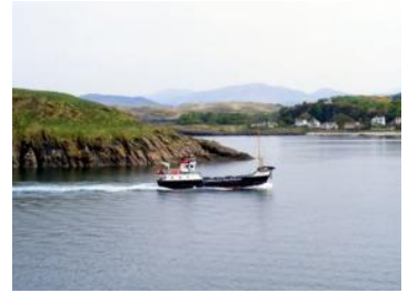
Raasay returning to Oban as spare vessel

10/05/08 Loch Buie had her repairs completed today and returned to Oban for an overnight berth, arriving at 1830.