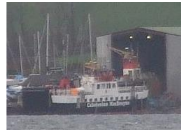
Loch Tarbert at Ardmaleish

Sailings crunning approx 30 minutes late