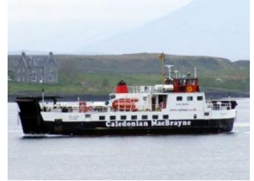
Loch Buie in Oban Bay

10/05/08 Loch Buie had her repairs completed today and returned to Oban for an overnight berth, arriving at 1830.