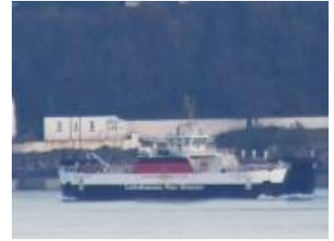
Loch Alainn heading for Gourock

03/11/08 Having undergone minor modifications at Ardmaleish, Loch Alainn left the Bute yard today and made her way to Gourock where she will lie until the time comes for her to relieve Loch Dunvegan on the Cointraive - Rhubodach crossing. This is expected to happen this coming weekend. Coruisk took her place in Garvel dry dock today to undergo her annual overhaul.