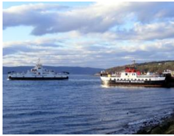
Loch Tarbert with Loch Shira

Isle of Cumbrae has arrived in Gourrock from Rosneath, ending her winter lay-up. We expect her to relieve Loch Riddon later this week.