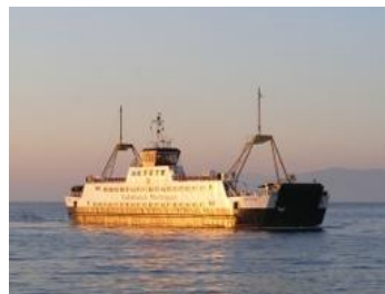
Fyne off Largs...

11/02/08 Loch Fyne left Kennacraig this morning and rounded the Mull of Kintyre. She arrived at Largs in glorious sunshine at 1645 and unloaded crew cars before tying up on the outside face of the pier. Her route took her up the east side of Arran during the course of this afternoon, as opposed to the preferred route of the smaller Lochs, via the Kilbrannan Sound