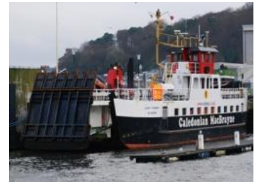
Loch Tarbert at Rothesay today

Loch Tarbert made for Ardmaleish this morning.