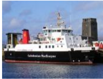
Lochnevis sitting pretty in JWD

In non-weather related news, Saturn and Lochnevis both reappeared in JWD today for the last bits of their overhauls to be carried out. Lochnevis is due back at Mallaig on or about 31st October to allow Loch Bhrusda to head up to the Sound of Barra and relieve Loch Alainn .