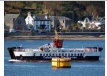
Loch Riddon in Rothesay Bay

Caledonian Isles is spending tonight in Brodick, due to adverse weather. Tomorrow's first sailing will be the 0820 from Brodick. Just a reminder, for all disruptions information please see both CalMac's service status page on the link above and also our Forum disruptions section here .