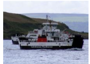
Loch Bhrusda on Cumbrae relief service

Loch Bhrusda took over from Loch Riddon on the Largs - Cumbrae Slip second vessel roster today. Loch Riddon has gone up to Greenock for repairs to a ramp hinge.