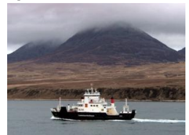
Coruisk in the Sound of Islay

Coruisk in turn set sail down the Clyde, passing Brodick at around 1245. She is spending tonight in Craignure after rounding the Mull of Kintyre and passing through the Sound of Islay. She was seen passing by Port Askaig as the light faded this evening.