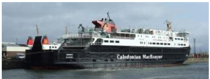
Hebrides back in JWD with Bute in the dry dock

05/03/08 Loch Bhrusda again left Rothesay harbour this morning and we understand that she relieved Loch Dunvegan for a very spell on the Colintraive - Rhubodach run, finishing at 0915 before returning to Rothesay at 1020. As yet we do not know the reason for this relief trip.