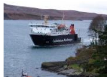
Lord of the Isles at Port Askaig