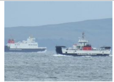
Loch Bhrusda passing Bute en route for Rosneath

Loch Bhrusda left Ardmaleish this afternoon and proceeded north to her lay up berth at Rosneath. While on the slip on Bute she was fitted with AIS equipment.