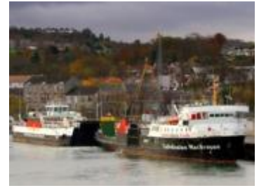
Jupiter off duty at the wires with Loch Alainn

08/11/08 A little disruption today, with Caledonian Isles once again spending tonight at Brodick, although rather than cancelling the first sailing tomorrow, she will carry out an unscheduled 0820 sailing from Brodick - weather permitting of course!