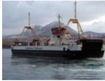
Loch Fyne leaving Port Askaig...

03/03/08 Loch Fyne left Port Askaig at 0715 this morning and made her way through the Sound of Islay and up through the Firth of Lorn. She was heading back to Craignure for an overnight berth, where she will lie until Wednesday morning. She will then resume service, taking over from Loch Alainn .