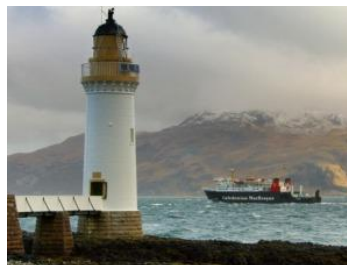
Lord of the Isles off Rubh na Gall

Eigg carried out a fuel run today from Oban to Craignure. She left Mull at approx 1155