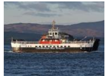
Loch Alainn entering Oban Bay

Loch Alainn was spotted leaving the Sound of Mull and following the Isle of Mull in to Oban. She is spending tonight there before continuing her journey to the Clyde. This means that Loch Bhrusda is now employed as the winter Barra - Eriskay ferry, having herself been relieved by the Lochnevis at Mallaig