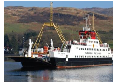
Loch Dunvegan the other way round

Loch Dunvegan was spotted sailing the opposite way round to normal today, berthing stern-first at Rhubodach and bow-first at Colintraive