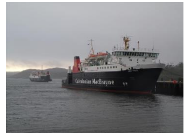
Lord of the Isles in Stornoway with Pentalina B leaving behind

Lord of the Isles left Lochboisdale at 0820 and arrived in Stornoway at 1415. She will take over the overnight freight run to Ullapool tonight for three nights.