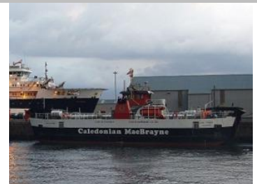
Loch Tarbert in JWD

30/04/08 Loch Tarbert's work which required dry docking finished today and she moved round into JWD for finishing off.