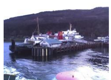
Isle of Arran lying at Craignure