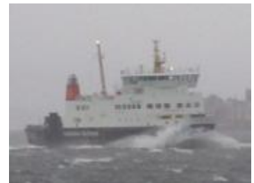
Argyle returning from Gourock to Rothesay

It appear that Cumbrae did have a normal day though, with nothing showing on the disruptions page.