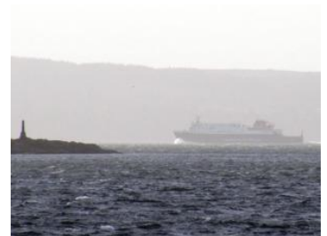
...and passing the Cumbrae war memorial

09/03/08 Loch Tarbert completed her journey back to the Clyde today. She left Craighouse on Jura at 0600 this morning and made her way directly round the Mull of Kintyre to Lochranza. She will now lie there idle until the start of the summer timetable on Good Friday.