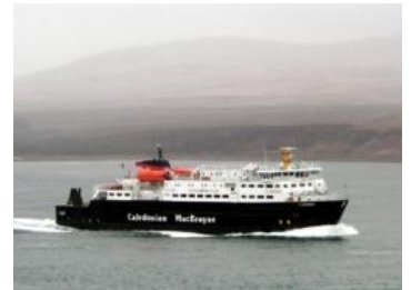
Clansman passing Port Askaig

27/01/08 Clansman is indeed on her way south today, having passed through the Sound of Mull and Sound of Islay earlier this morning. She would have passed Isle of Lewis during the early part of her journey as the larger vessel made her way back to her namesake isle, ready to return to service tomorrow morning. Clansman is expected to arrive at around midnight on the Mersey.