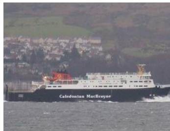
Hebrides heading down the Clyde...