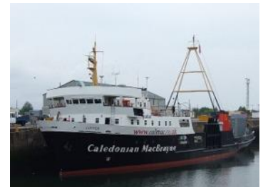
Jupiter in JWD

Jupiter emerged from Garvel dry dock today and was repositioned in JWD to have her annual overhaul completed. She is expected back in service in the next week to allow Saturn to go down to Ardrossan to commence her summer duties as second Arran vessel. These duties will now see her carry out up to four return sailings a day and she will be based overnight in Ardrossan.