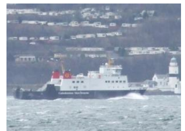
Bute returning from Gourock

Services from tomorrow will be operating to and from Kennacraig until further notice. Departures from Gigha 0730, 1130 and 1500, returning from Kennacraig at 0915, 1315 and 1635. Bookings are essential for