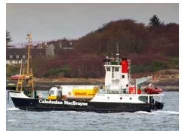
Eigg approaching Craignure