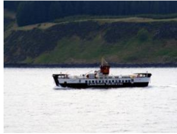
Loch Linnhe returning to Tobermory

11/05/08 Musical ferries today as Loch Buie sailed from Oban direct to Fionnphort in order to resume her normal duties. This freed Loch Linnhe to head around the north end of Mull, back to Tobermory, passing Clansman in the northern end of the Sound of Mull. Raasay in turn returned to Oban