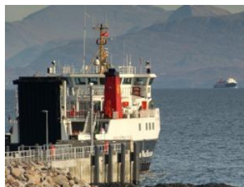
Isle of Arran passing Lochnevis at Eigg

15/02/08 Isle of Arran took advantage of the glorious weather today and diverted via the Skye Bridge, Kylerhea narrows and the Sound of Sleat, following in the wake of Lochnevis from Mallaig to Muck. She was spotted by SoC off Eigg at around 1215. She then passed Craignure at 1430, just ahead of Lord of