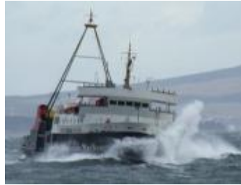
Jupiter off Dunoon

Caledonian Isles diverted her 1105 ex Brodick sailing to Gourock and was in good company while she was there, for the Rothesay ferries were also using Gourock, and even Loch Dunvegan put in an appearance, making for the shelter of the wires.