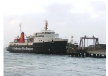
...and alongside at Caignure

Loch Bhrusda is now back at Rothesay's inner berth, having finished her overhaul at Ardmaleish